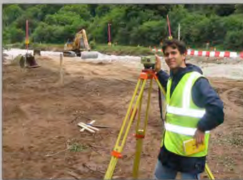
German IAESTE Trainee

IAESTE is a worldwide non-profit network which arranges paid, relevant work traineeships in the fields of Science, Engineering, Architecture and IT. Every IAESTE member country works with employers in their own country to establish offers of traineeship, and then exchanges these for traineeships abroad. Interested students apply in their own countries for placements in other countries (you cannot do a traineeship in your own country!). Applicants must be registered in full-time third-level education above first year B.A. level at the time they make their application. As well as finding the placement, IAESTE arranges or provides assistance with accommodation, visas, work permits, and reception services in the receiving country.