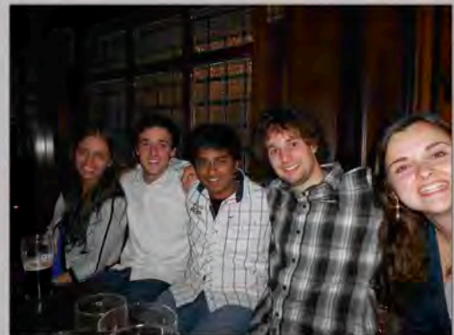
Irish IAESTE Trainees